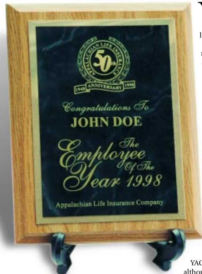
Art and text created in CorelDraw, lasered onto Green Mist brass plated steel and mounted onto an imitation oak board. The most important thing to remember when lasering metal is not to burn the images too hot.

OU CAN'T ENGRAVE METAL WITH A CO2 LASER. As true as that is, metal is perhaps the most common material used with a laser engraver. So what's the deal?