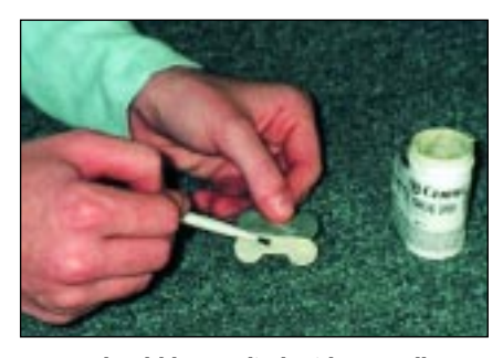
Certec should be applied with a small airbrush but in the absence of compressed air, it can be brushed on with a small brush for dog tags and other small items or a foam brush for larger items. A smooth even coat is necessary for good result.