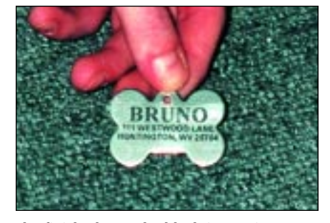
The finished tag. The black image is actually etched into the stainless steel and is permanent.